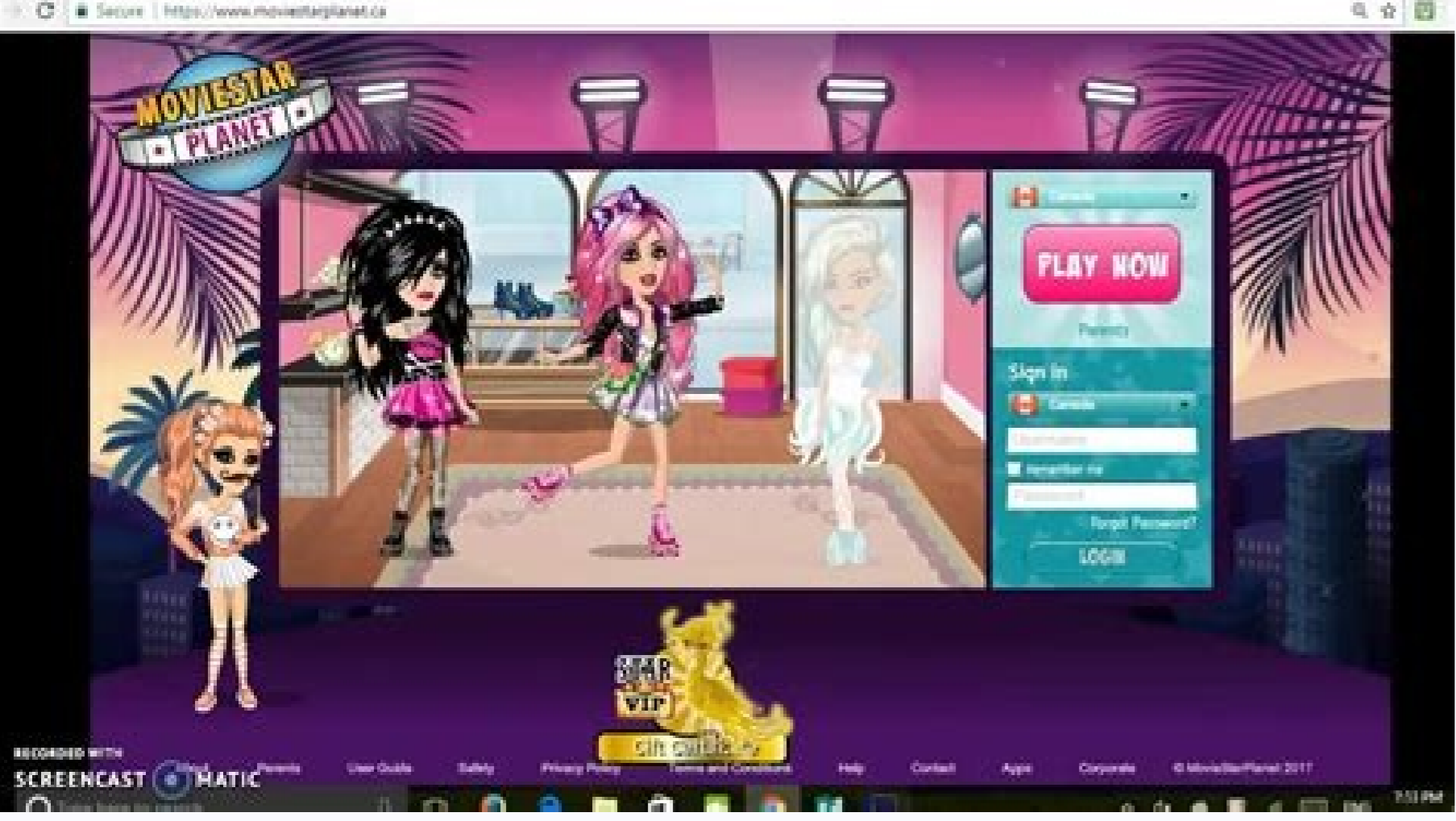
Generateur starcoins msp sans verification humaine. Generateur mot de passe msp sans verification humaine. Msp generator vip gratuit sans verification humaine. Generateur msp gratuit sans verification humaine.